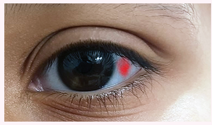
Fig. 1: Subconjunctival hemorrhage.