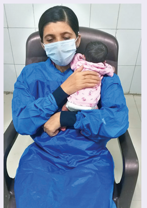
Fig. 3: Burping